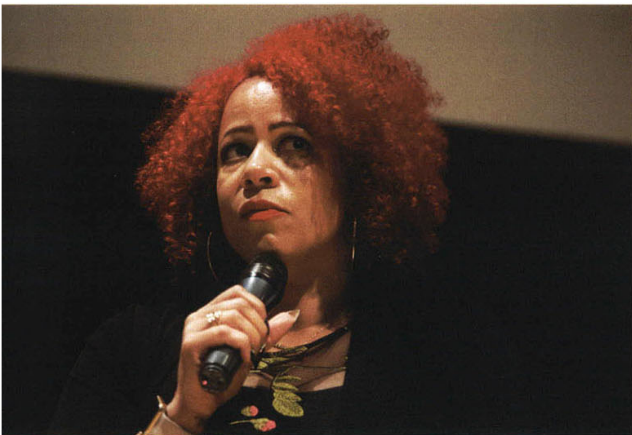
Fraud taken seriously: 1619 Project creator Nikole Hannah-Jones, who has previously published vitriolic racism against “whites,” won a Pulitzer Prize for her fake history of America.

In short, under the view put forth by the Times and its project, the only possible conclusion is that America must die so that something new can replace it. That is the objective.