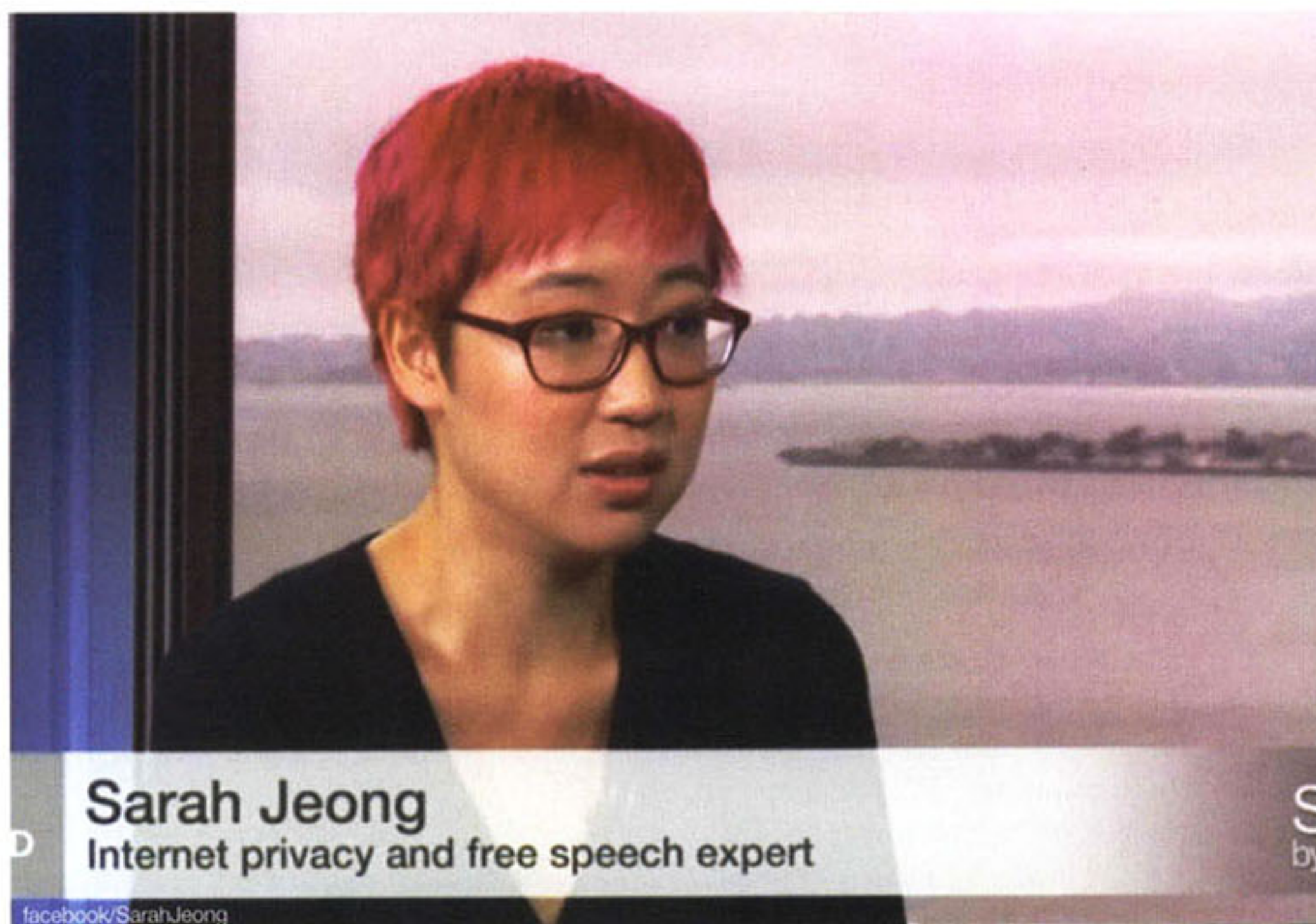
An anti-white racist: The Times hires vulgar racists such as Sarah Jeong, who gets “joy” from “being cruel to old white men” and thinks whites must “live underground like groveling goblins.”

Hannah-Jones also fails to mention several indisputable facts that completely contradict her racism narrative. For instance, immigrants to America from Nigeria tend to do better than European-descent Americans born in America, according to a study by the Migration Policy Institute. How could this be possible if America is a white supremacist